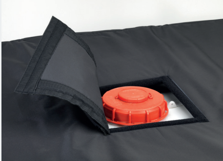
Flap for filler access.