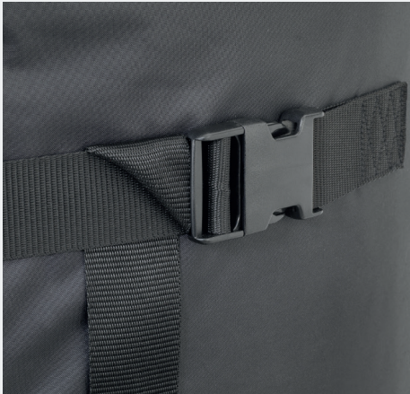
Quick release buckles are used for fixing the jacket quickly and easily.