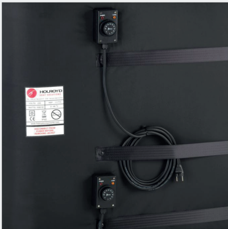
Bespoke printing for the HIBC/B is available, detailing your company information and specifications for the element.